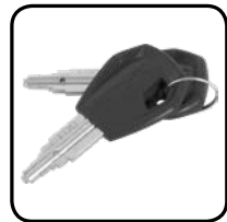
Keys x 2