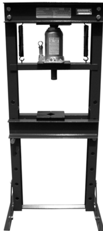
HYDRAULIC SHOP PRESS

Distributed by Kincrome Group www.kincromegroup.com