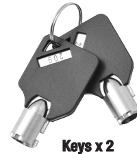
Keys x 2