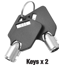
Keys x 2