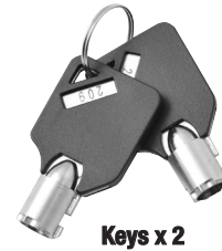
Keys x 2