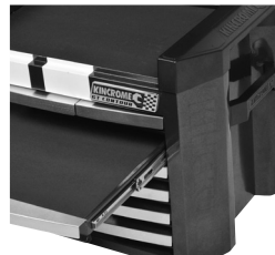
Hard Close drawer system