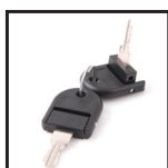
Keys x 2