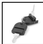
Keys x 4