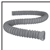
KP1004 Ducting Not included

Contact your local Kincrome dealer or visit our website at www.kincrome.com.au for more information